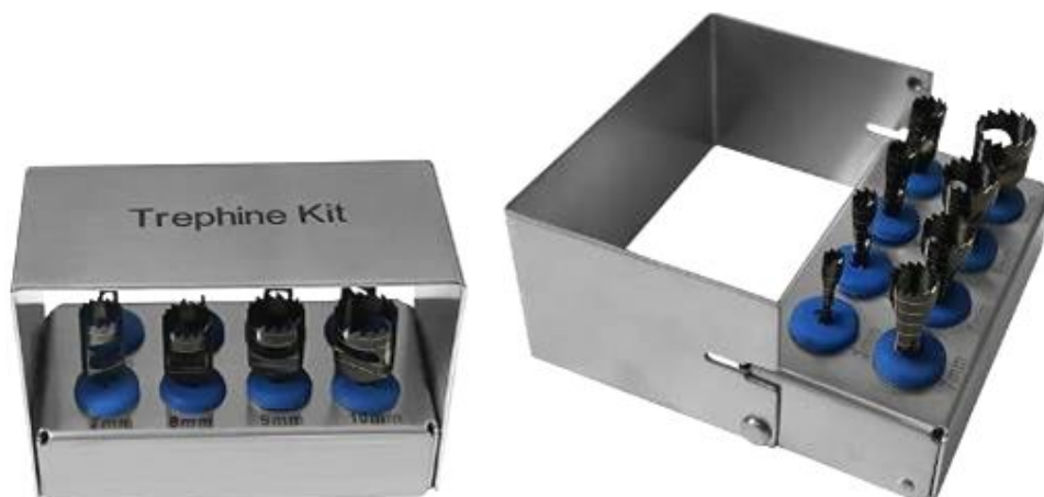
Trepine Drill Kit, 8 pcs.